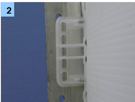
2 Position the curved section of the signAclip against the fin with the predrilled holes