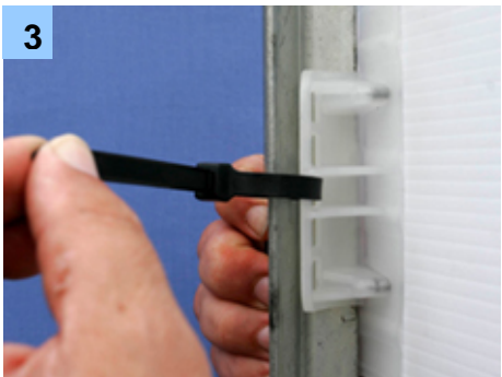
3 Slide the signAclip over a predrilled hole on the star picket and insert and tighten a single cable tie