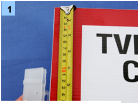
1 Positioning signAclips Fit the signAclip at least 80mm from the top of your sign.