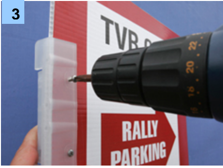
3 Securing signAclips Secure the signAclip in place by inserting 2 x 6 gauge screws into the clip. Do not over tighten screws.